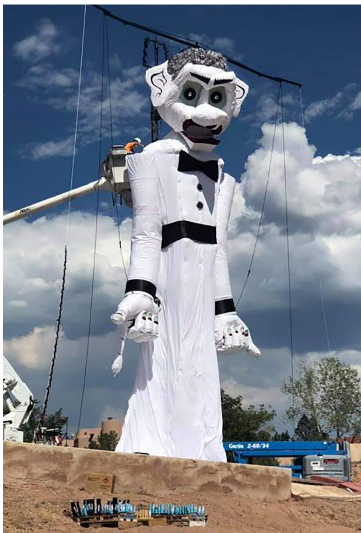
Zozobra Being Assembled at Ft. Marcy Park