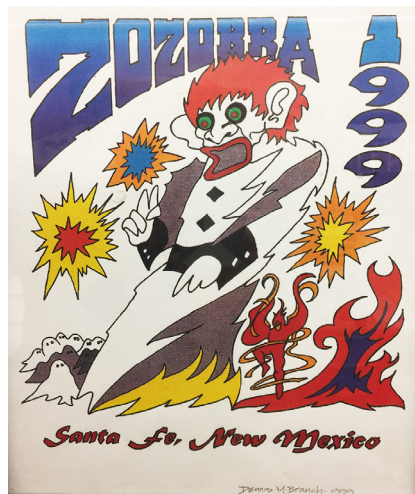
D. Branch T-Shirt Contest Entry 1999