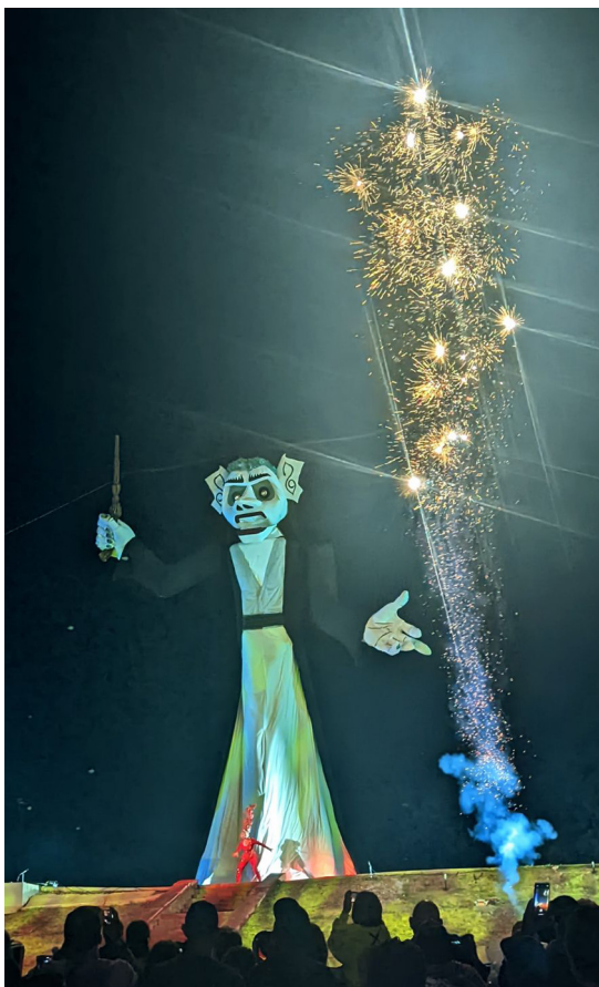
Zozobra Now and Then

The deputy state historian continued fulfilling duties as both historian and grants administrator of the NMHRAB re-grant program. She gave lectures and presentations via Zoom and in person. In April she served as a judge for the National History Day competition. She consulted with outside institutions and organizations on New Mexico History and assisted with transcription of documents from the State Archives. She wrote two articles for the OSH website. She also conducted interviews for several news programs and for magazine and newspaper articles.