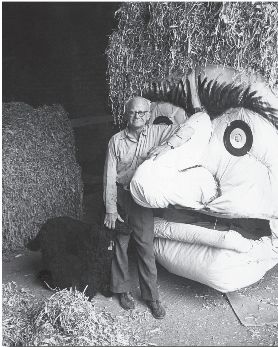
Will Shuster with Poodle "Tutu," from the Bullock Collection #30908, 1960, Courtesy of the State Archives of New Mexico