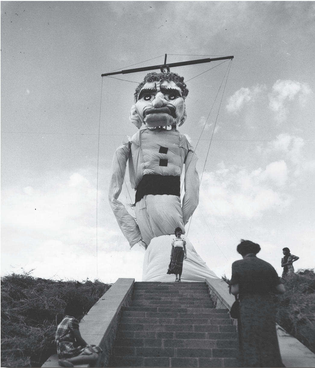
Visiting Zozobra, from the SRCA Collection #0062, 1952