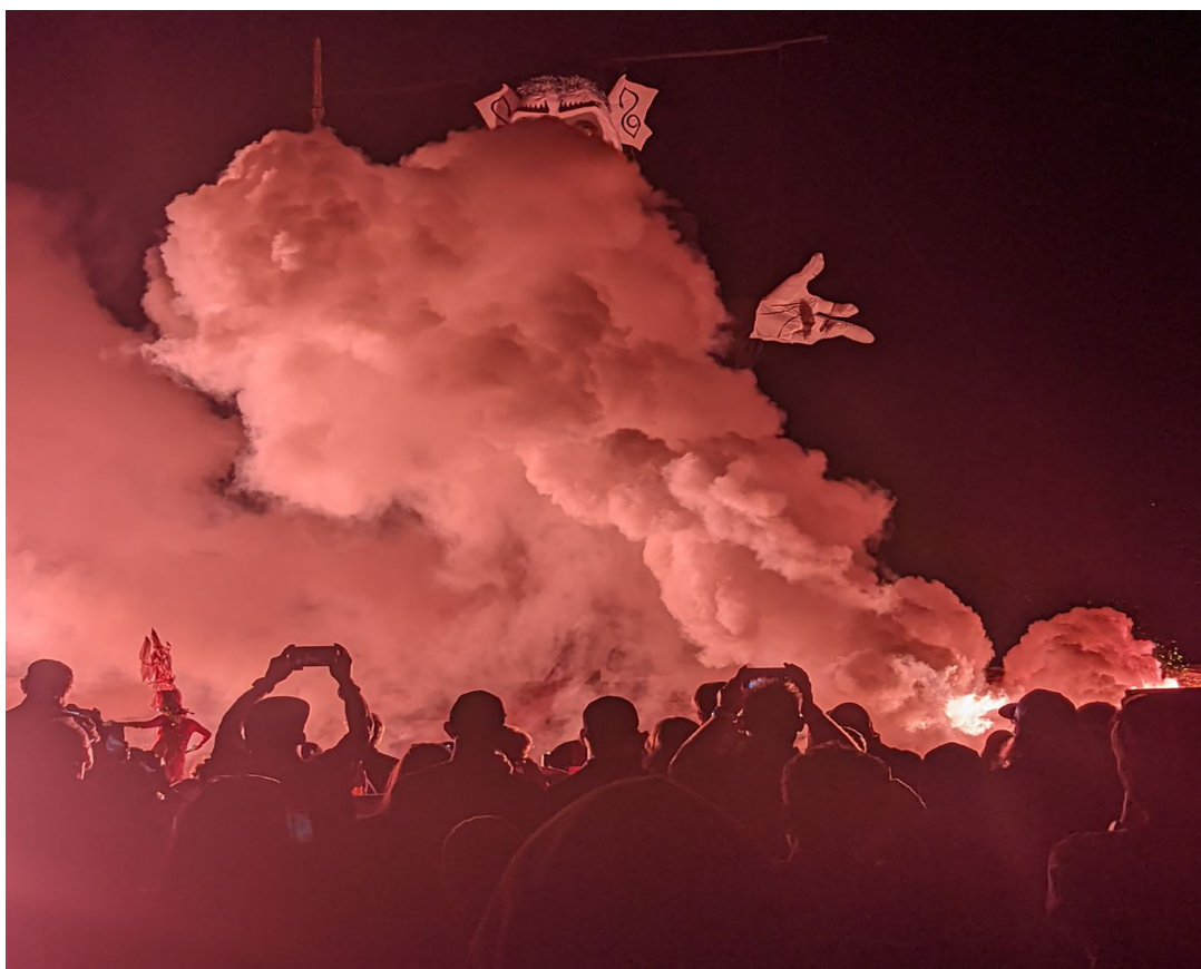
The Crowd Chants "Burn Him, Burn Him!"

The Records Management Division (RMD) staff provided 33 online records and information management trainings to records liaison officers, chief records officers, and employees of state and local government entities. The RMD safely pulled and processed 3,720 boxes within 24 hours upon request. In addition, 689,943 units of public records that met their legal retention were validated and processed.