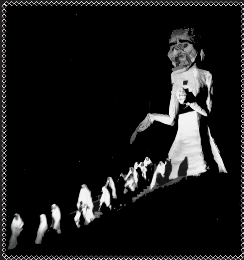
Gloomies Ascending on Zozobra, from the SRCA Collection #3539, 1952, courtesy of the State Archives of New Mexico