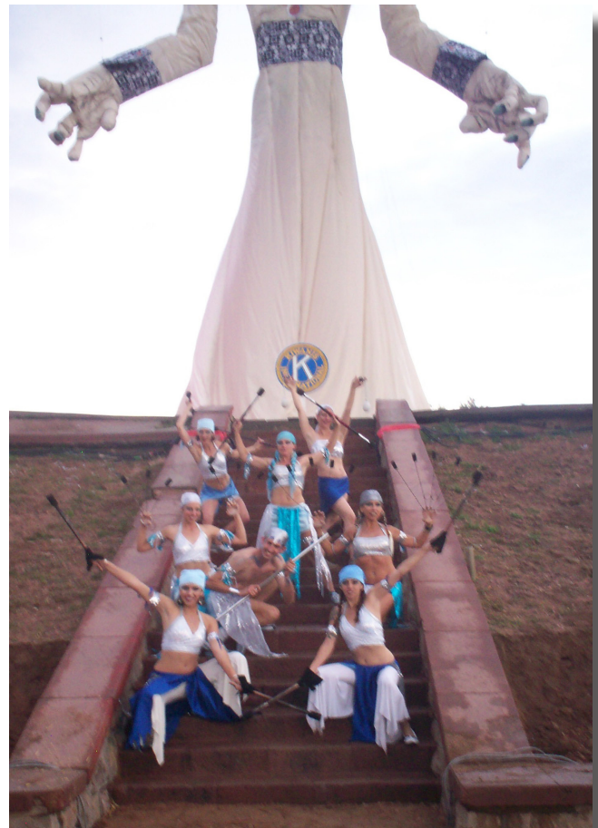
Fire Dance Performer Dress Rehearsal 2009

law enforcement, attorneys, the courts, scholars, and the public. These descriptive records help promote access and are used by all branches of government and the public. Researchers were assisted in person and remotely to provide access to archival collections. Archives staff satisfied 100 percent of requests within established timelines. Research needs of 323 requestors were satisfied on site in the research room, and there were 541 offsite/remote requests.