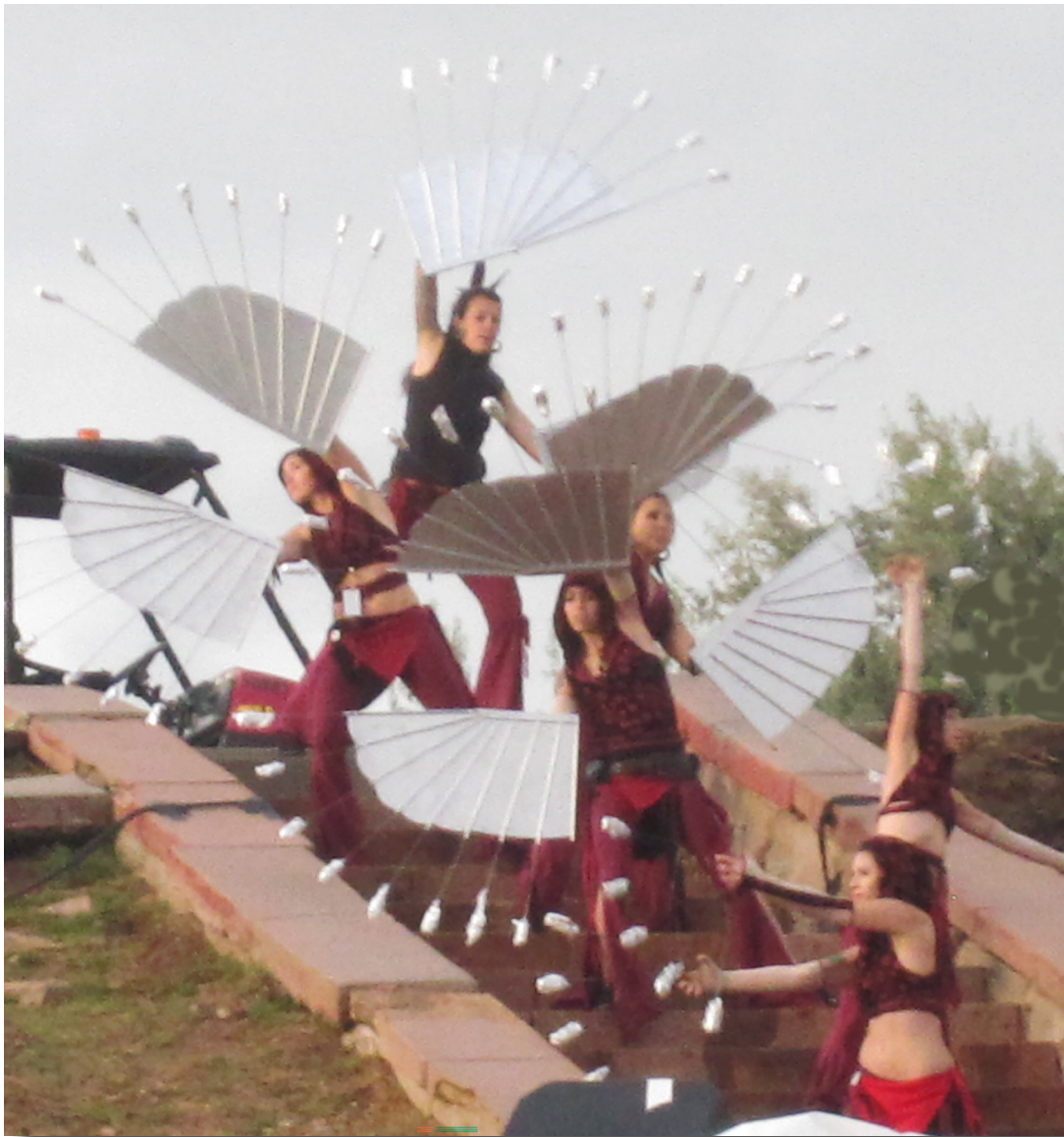
Fire Wings Dress Rehearsal 2010