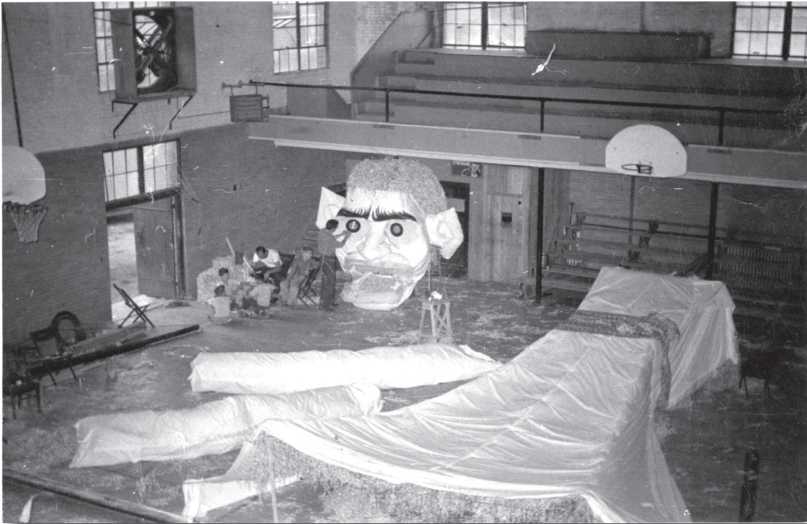
Zozobra Under Construction in Gym, from the Bullock Collection #31096, 1960, Courtesy of the State Archives of New Mexico