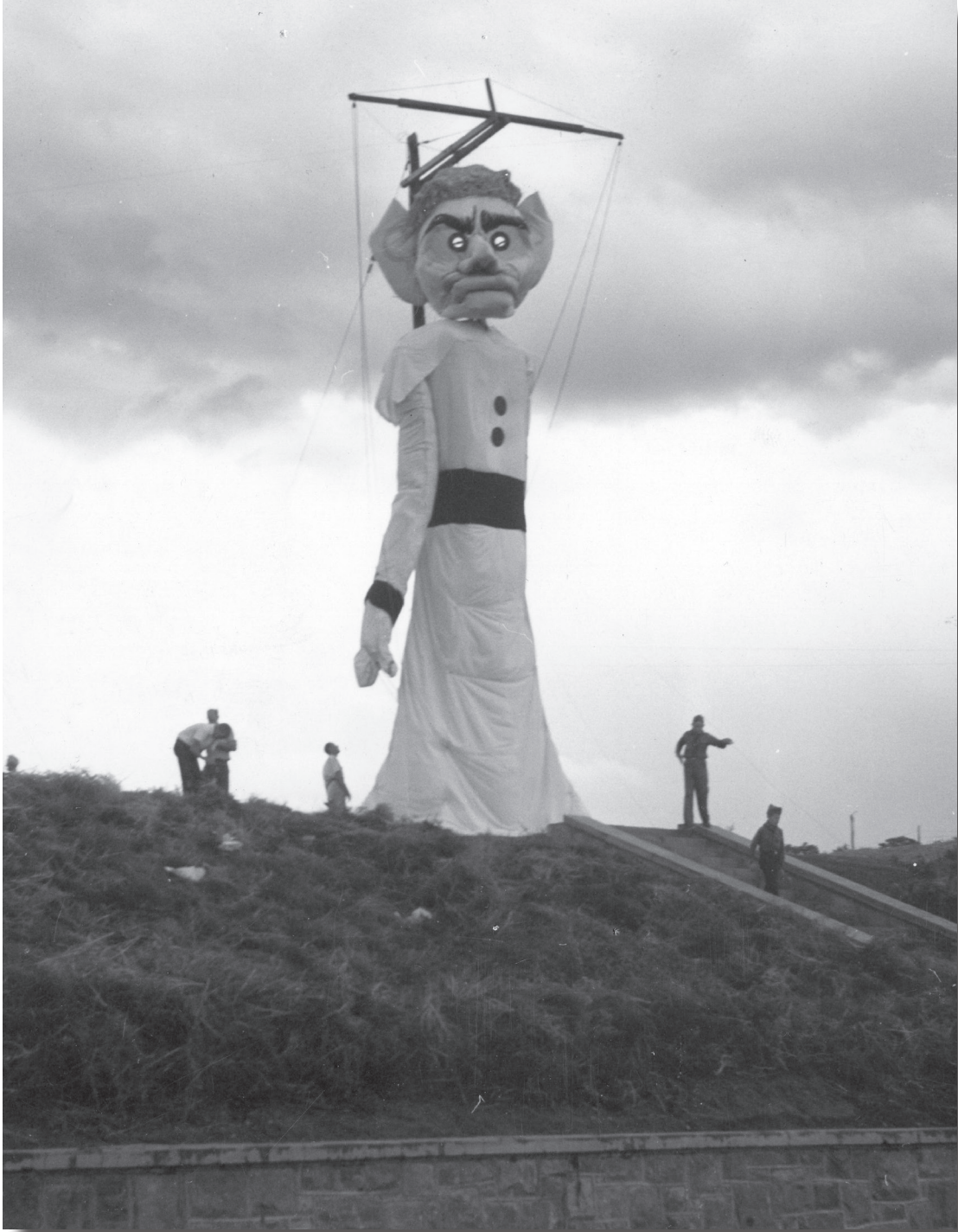
Zozobra Rehearsal, from the SRCA Collection #3478, 1936, Courtesy of the State Archives of New Mexico