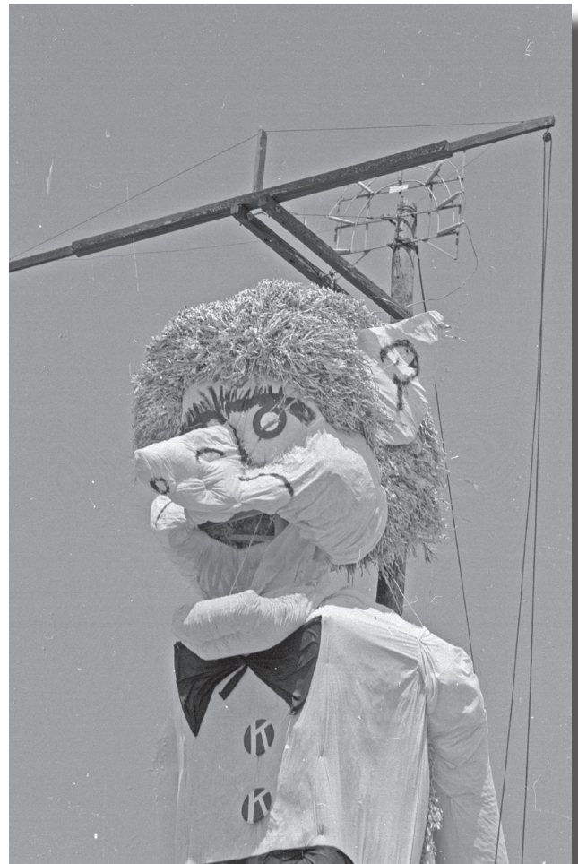
Zozobra Closeup, from the SRCA Collection #3557, 1964 ca., Courtesy of the State Archives of New Mexico

Division staff continued to provide a variety of services, including tours of the permanent repository; educating the public and other agency staff about agency services; consulting with all branches of government; collaborating with other agency divisions; providing information to potential donors, Archives Month partners, and the public about the permanent repository and our mission.