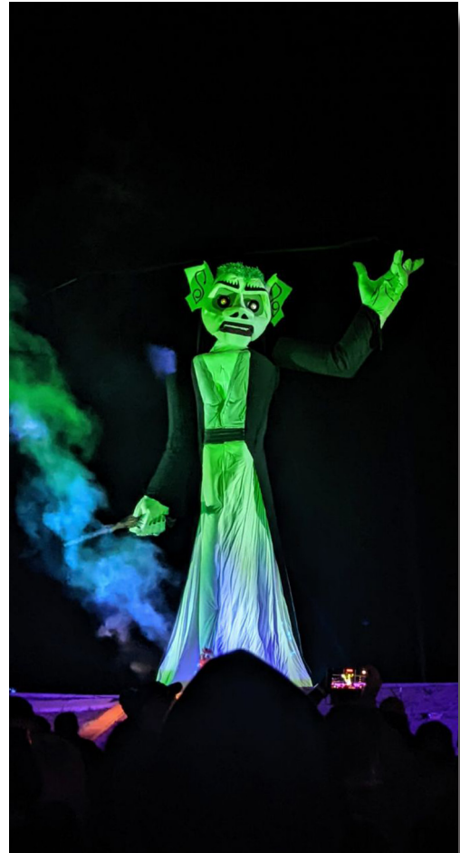
Zozobra 2023

The ITMD staff conducted an annual inventory of the agency's fixed assets and IT equipment. Additionally, the division continued to work to refresh the program and replace older desktop computers and deployed new notebooks/docking stations, full size monitors, soundbars and full-size keyboards and mice.