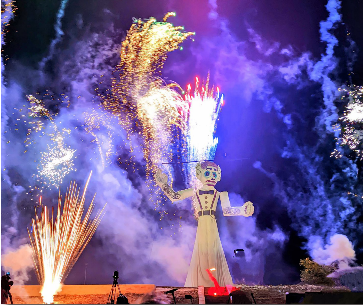
Zozobra Grand Finale 2022