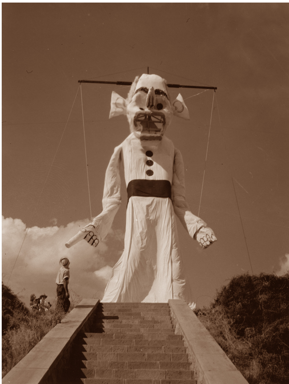
Visiting Zozobra, from the SRCA Collection #0953, 1945 ca., Courtesy of the State Archives of New Mexico